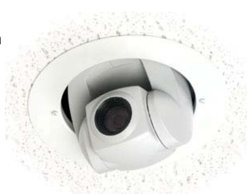
Figure 1: CeilingVIEW 70 PTZ

The Vaddio™ CeilingVIEW 70 PTZ is a complete, half-recessed, ceiling-mounted pan/tilt/zoom camera system. The system features a Sony EVI-D70C/W camera mounted into a recessed, metal ceiling camera enclosure backbox with ceiling tile support braces and the Vaddio EZCamera™ Cabling System. The EZCamera Cabling System allows the installer to use Cat. 5 cabling to run power, video and camera control. Also included is the Vaddio PowerRite™ power supply that regulates the right amount of power needed for the camera over Cat. 5 cabling. The CeilingVIEW 70 can be controlled with the IR Remote Commander or with RS-232.