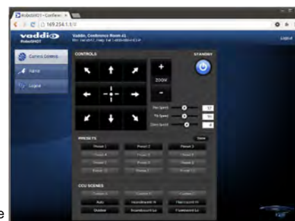
Image: Example of Built-in Camera Control Web Page

The RoboSHOT cameras were designed for the times and represent a new era in specifying and integrating professional quality cameras into A/V and conferencing system configurations. In short, it has never been easier to integrate cameras into any project than with the RoboSHOT HDMI cameras