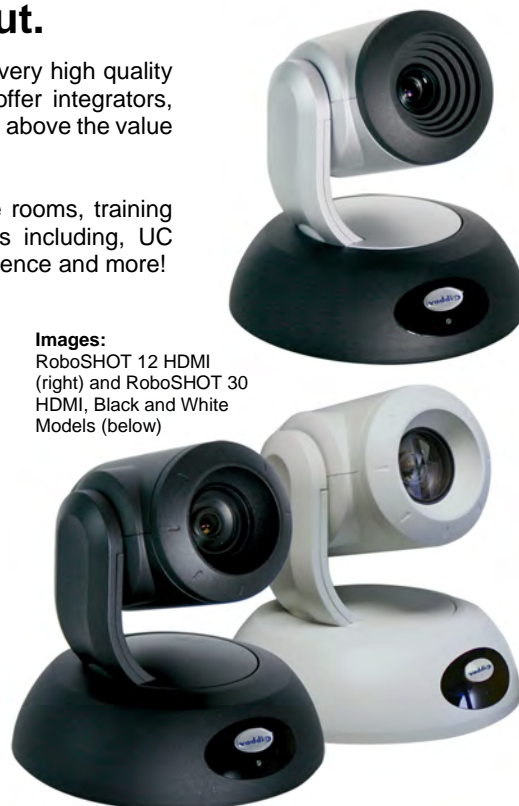
Images: RoboSHOT 12 HDMI (right) and RoboSHOT 30 HDMI, Black and White Models (below)