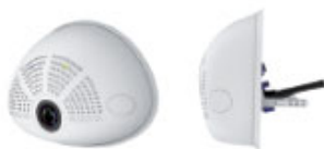
Lens tilted down 15 deg.