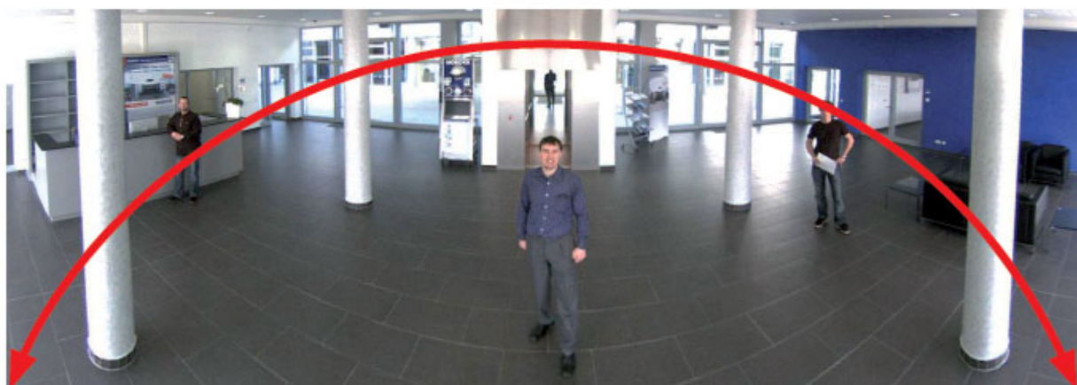
Wall-mounted i25 captures 180° field of view – no blind spots.