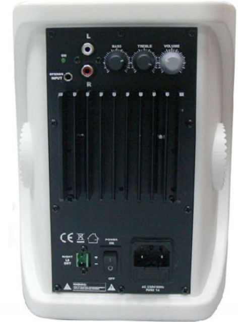
Traditional Analog Speaker 25 Watts per channel