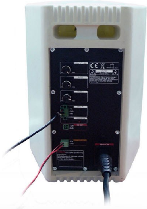
ABtUS ECO Digital Speaker 25 Watts per channel (SPS-S025A1)

Speaker system with following difference and changes against traditional Analog amplifier: