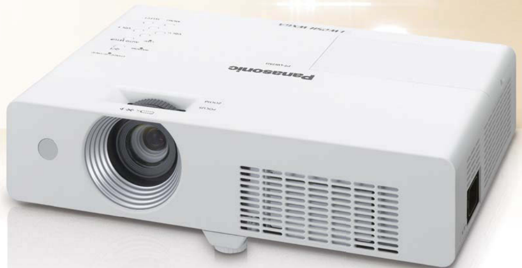
* Featured Image: PT-LW25H