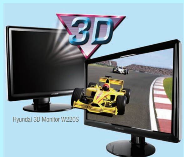
Hyundai 3D Monitor W240S

Hyundai W220S/W240S can display real 3D stereoscopic images with high quality polarized glasses. Hyundai 3D monitors have wide viewing features; which allow users to enjoy 3D visuals from every viewing angle. All Hyundai 3D monitors are adapted DDD's breakthrough 2D/3D solution; Tridef 2D/3D display software allows user to experience movie, picture and images in 2D or 3D viewing.